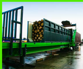
Loaded Tub is powered into the Container