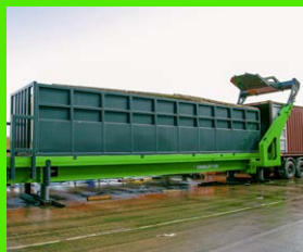
Logs are preloaded into the Tub & Container attached