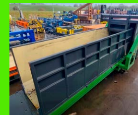
Hatch Opens Up & loaded Container is Detached.