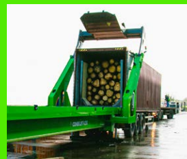
Hatch Closes Down