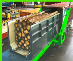
Loaded Tub securely inside Container.