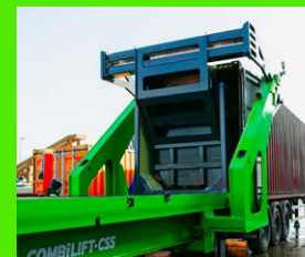
Hatch Locks Down & Tub Powers Out